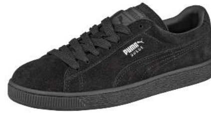
Sneakers and Slippers